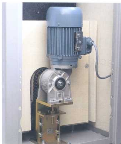
Drive unit of the gear pump